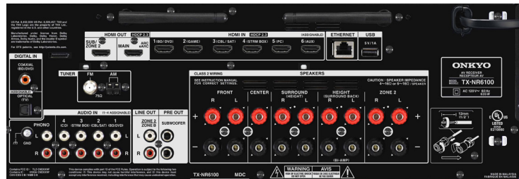
Text on receiver may vary with region.